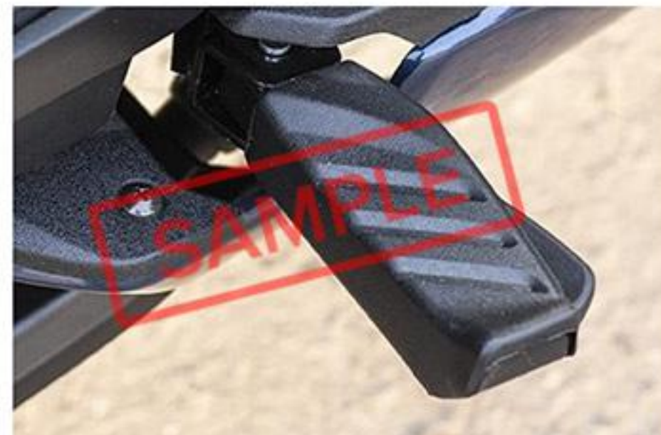
RIGHT SIDE FOOT REST