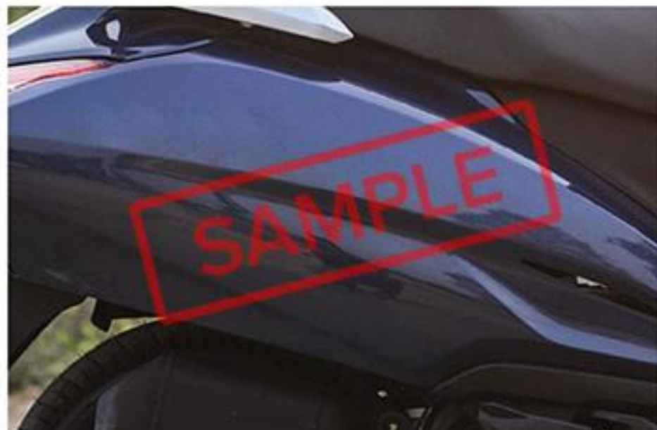
REAR RH SIDE PANEL