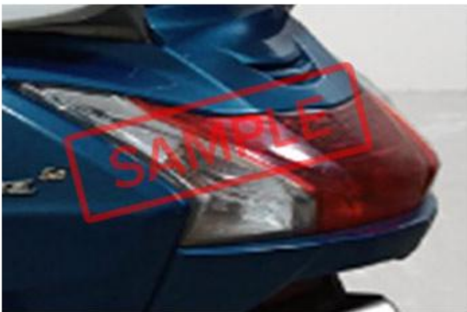
REAR LH INDICATOR