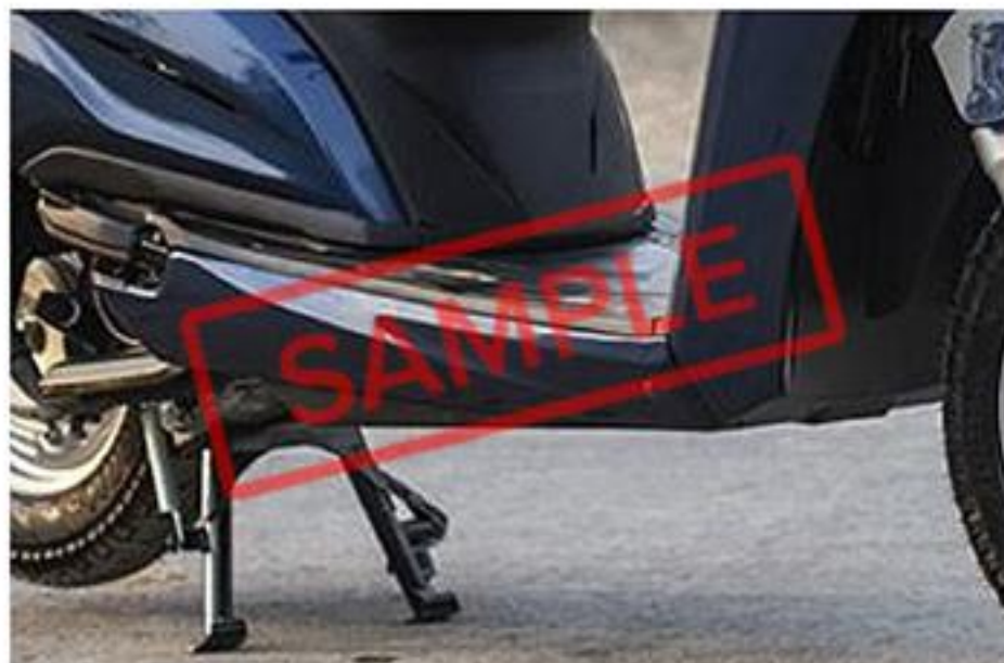
RIGHT RUNNING BOARD