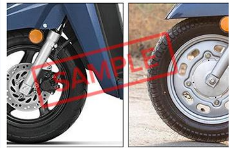
FRONT WHEEL RIM