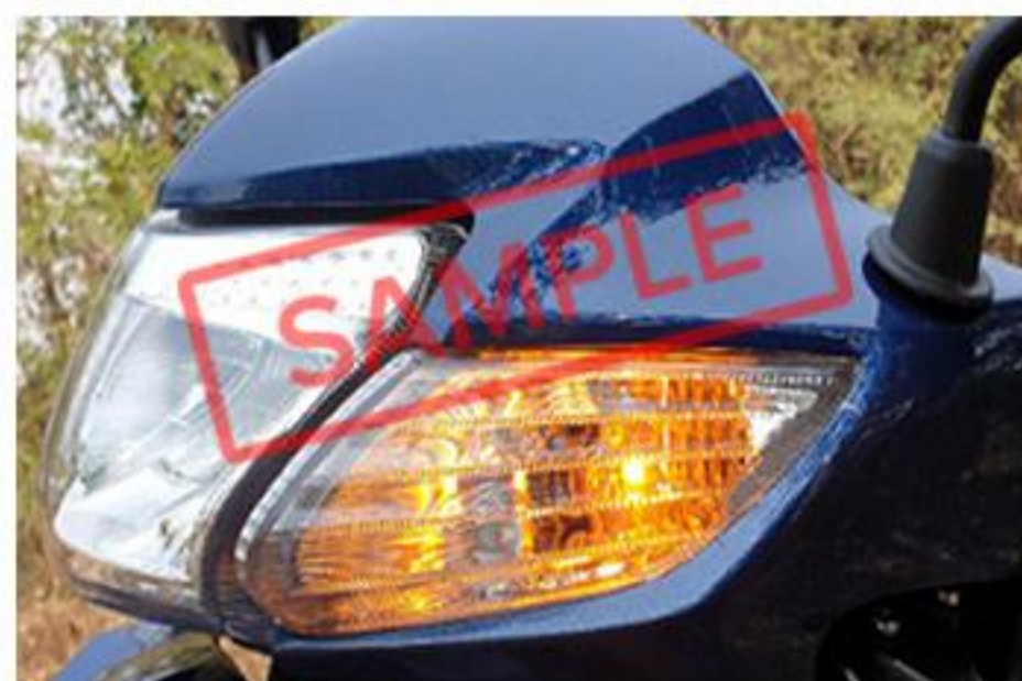
FRONT LH INDICATOR