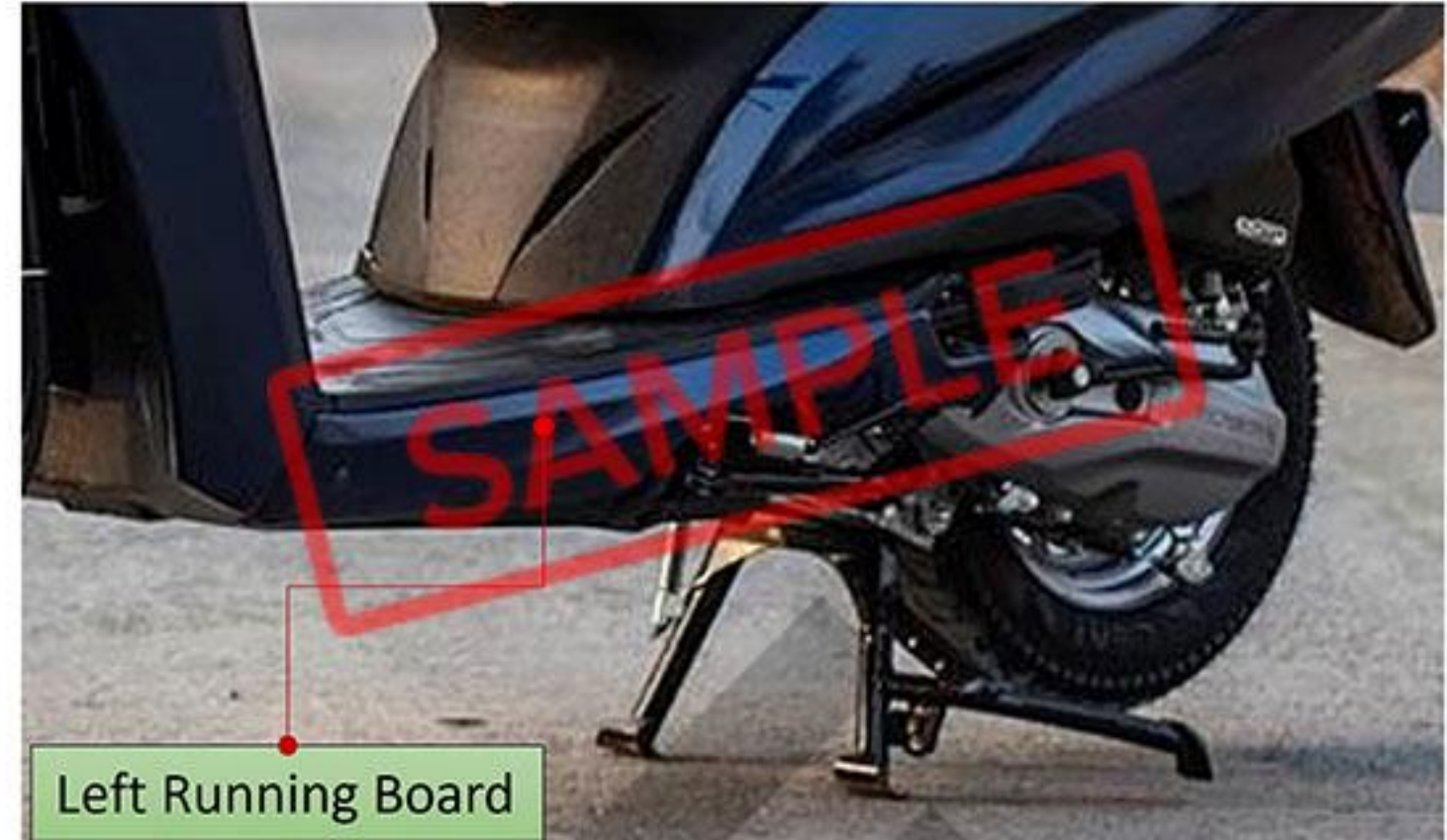
Left Running Board