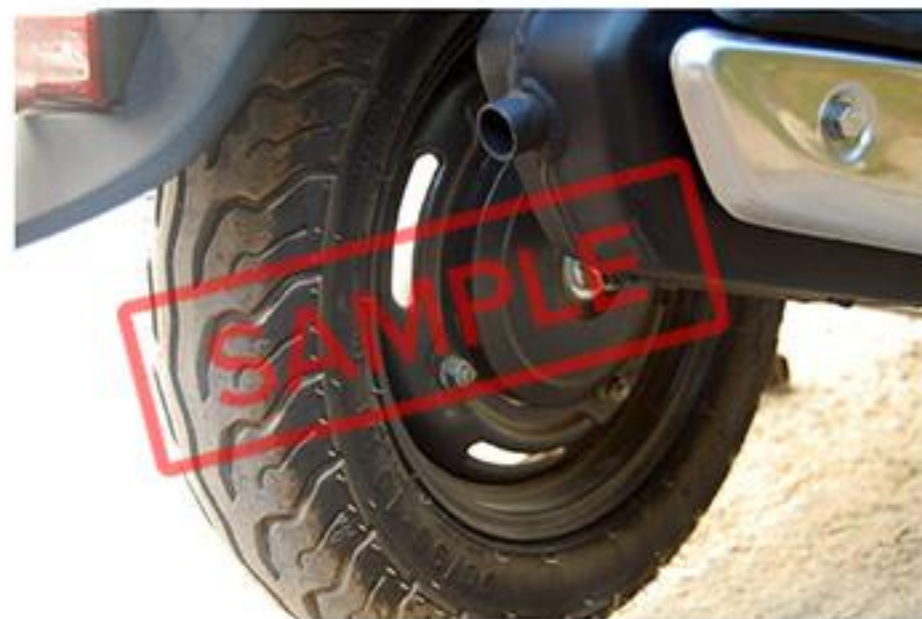
REAR TYRE CONDITION