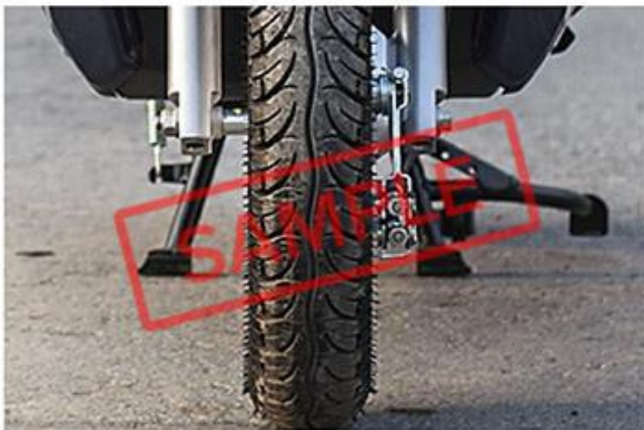
FRONT TYRE CONDITION