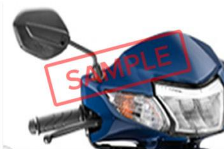
FRONT RH INDICATOR