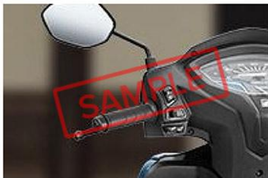
LH REAR VIEW MIRROR