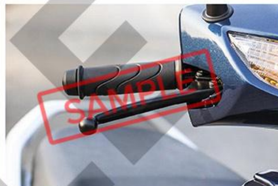
FRONT BRAKE LEVER