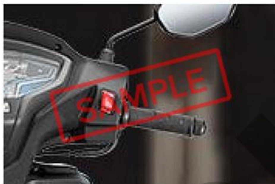
RH REAR VIEW MIRROR