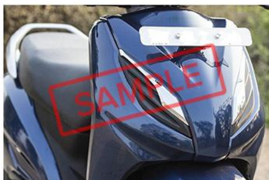
FRONT PANEL (APRON)